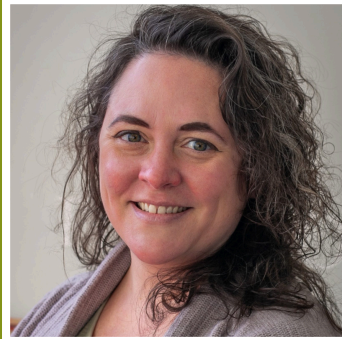
District 4 Knox, Lincoln, Sagadahoc, and Waldo Counties