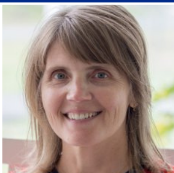
District 5 Kennebec and Somerset Counties