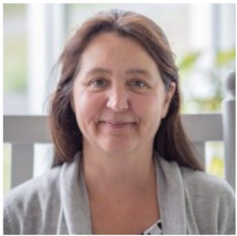
District 1 York County