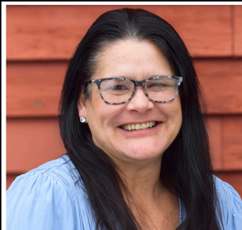
Statewide Inclusion Consultant