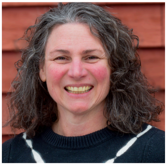
District 3 Androscoggin, Franklin, and Oxford Counties