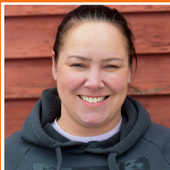
District 6 Penobscot and Piscataquis Counties