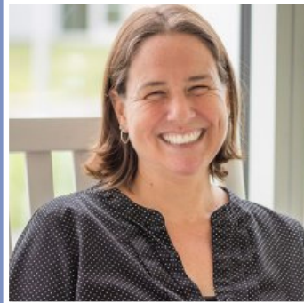
District 2 Cumberland County