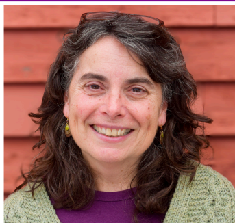
Part of District 7 Washington County