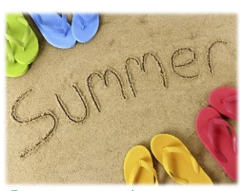
Enjoy your summer!

Finally, training enrollment and completion are typically lower during the summer months. In recognition of this, we have planned a break in our training schedule. MRTQ PDN plans to resume offering a full slate